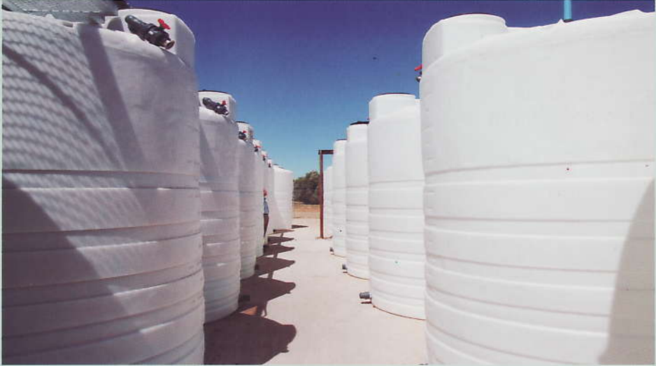
10 000 litre tanks