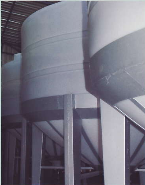
11 000 litre silos