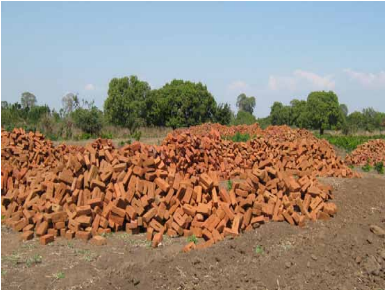
Mobilization of some construction materials