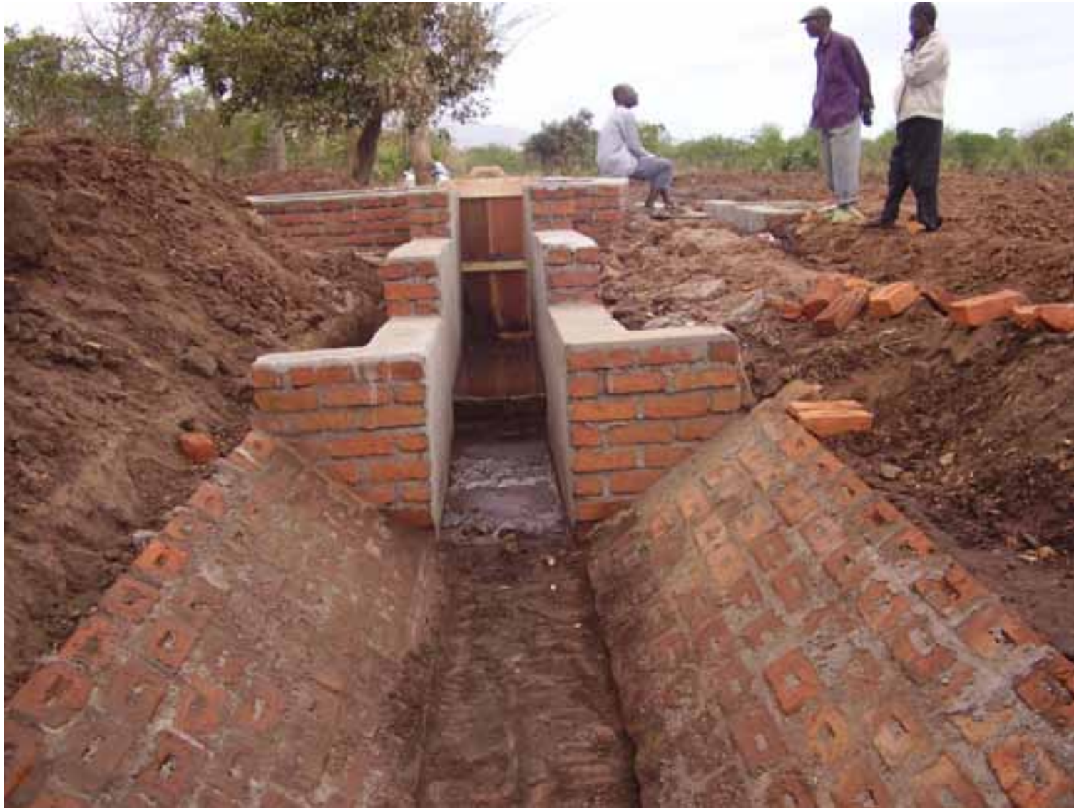
Main canal off take under construction