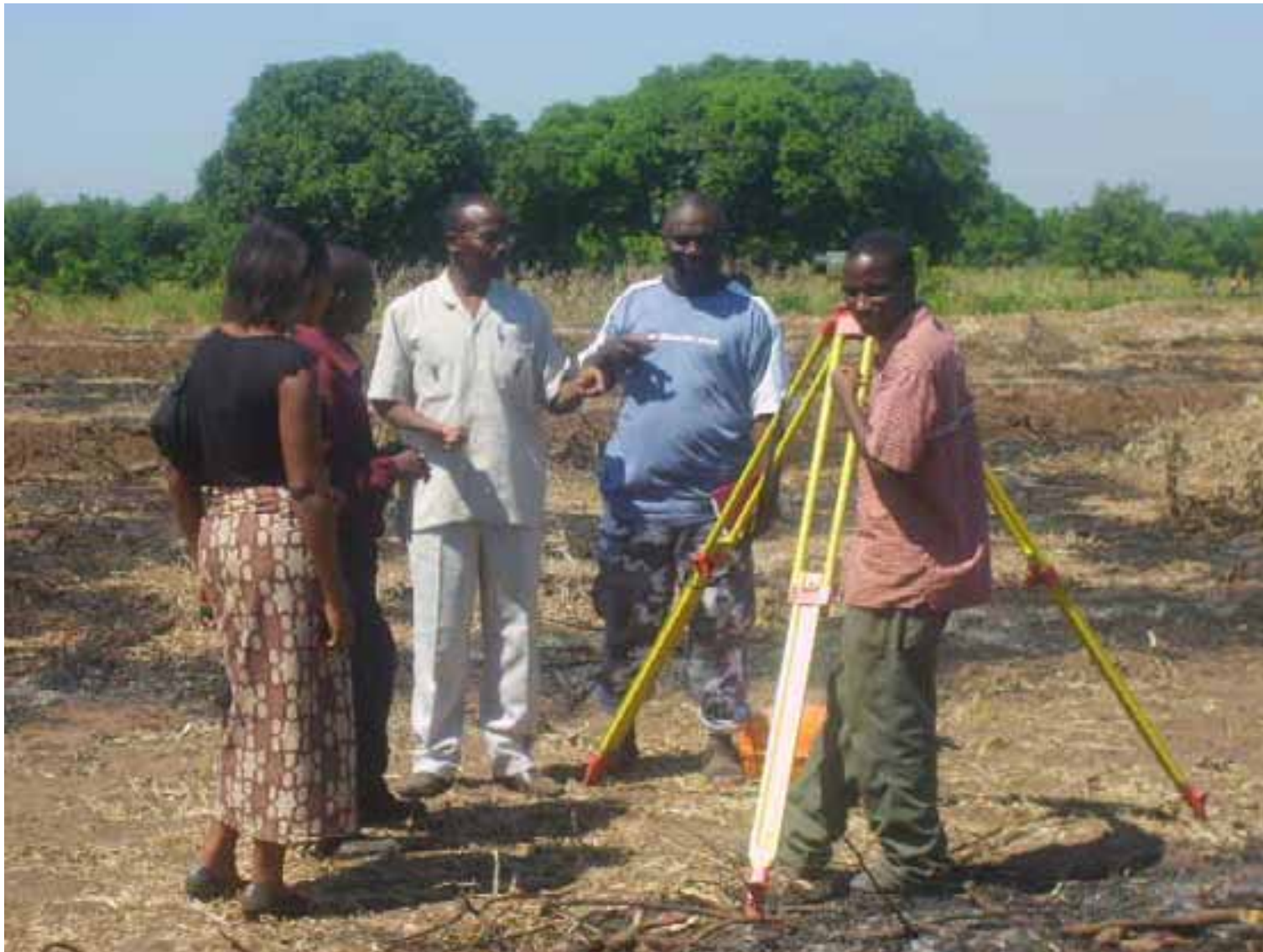
Implementers Team Consultation