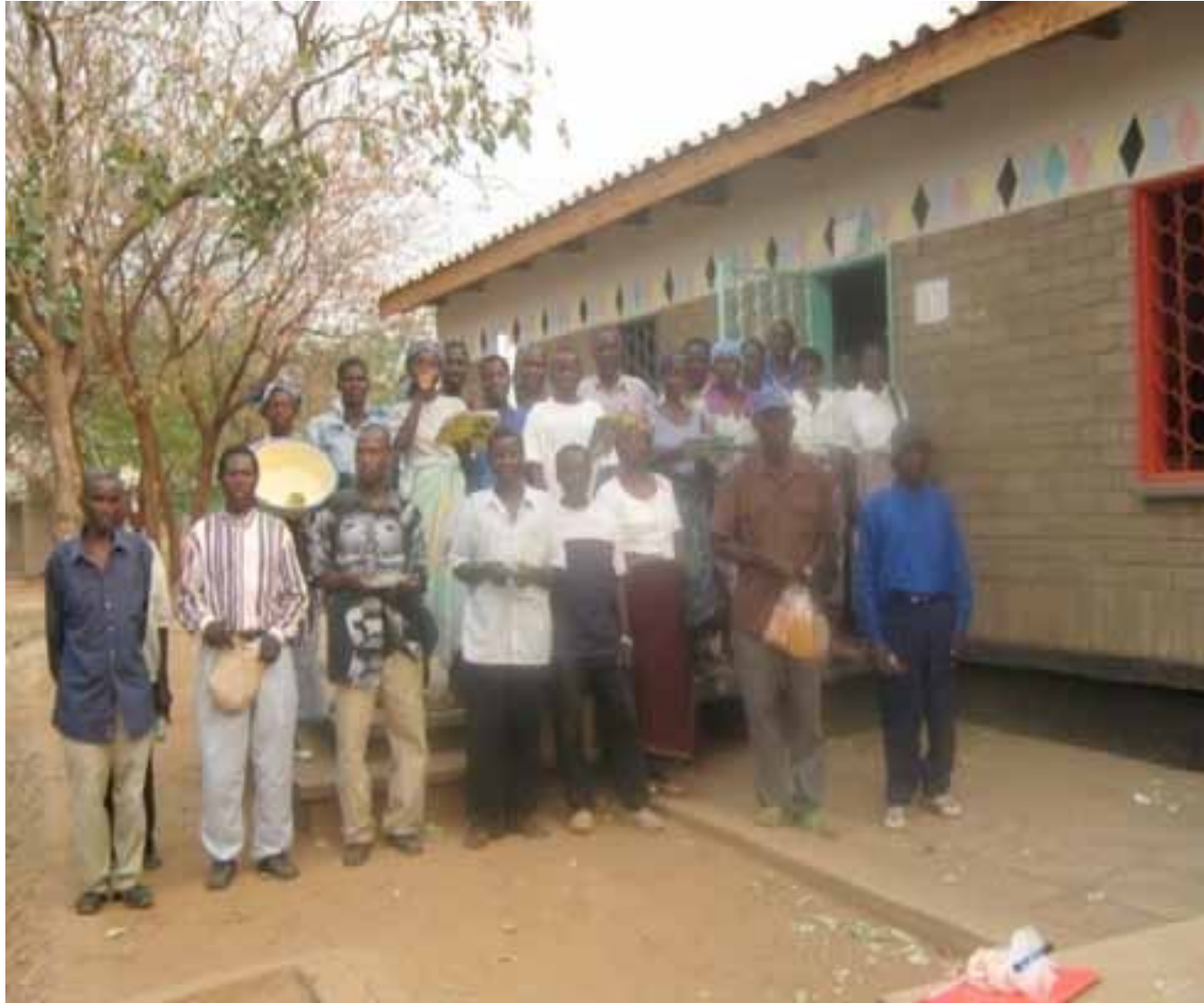
Community committee attending capacity building session