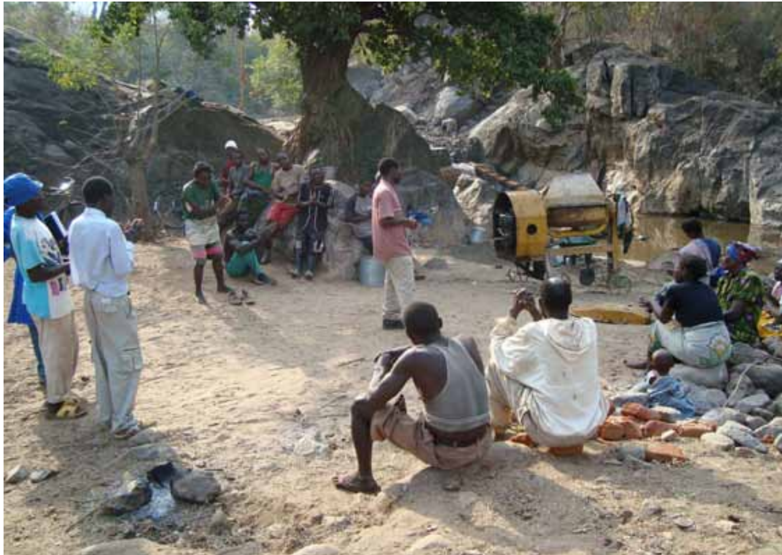
Planning for next day work