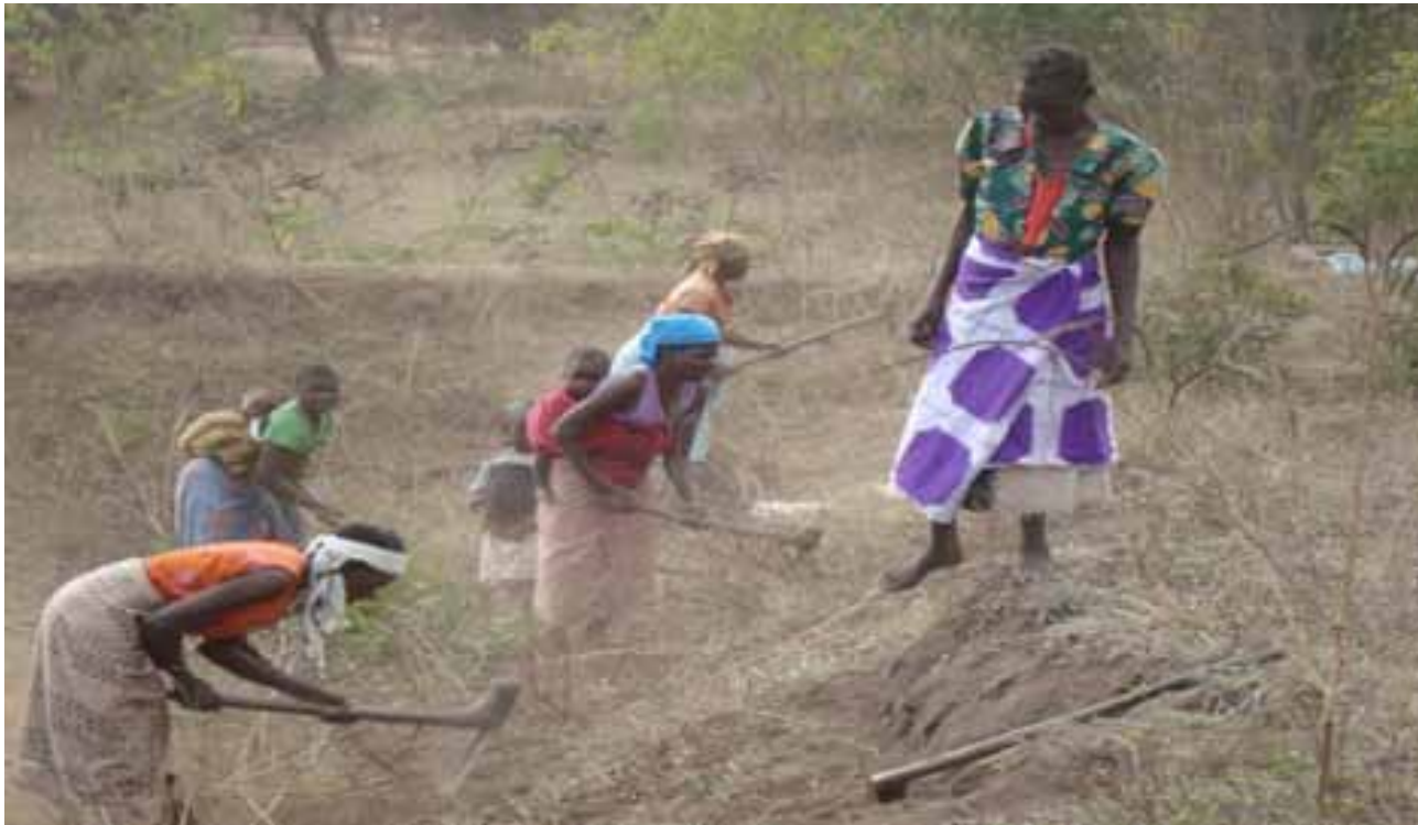
Bush clearing at the fish ponds