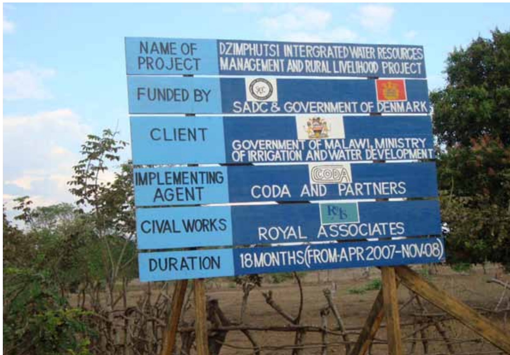
Partners in Development and Service providers