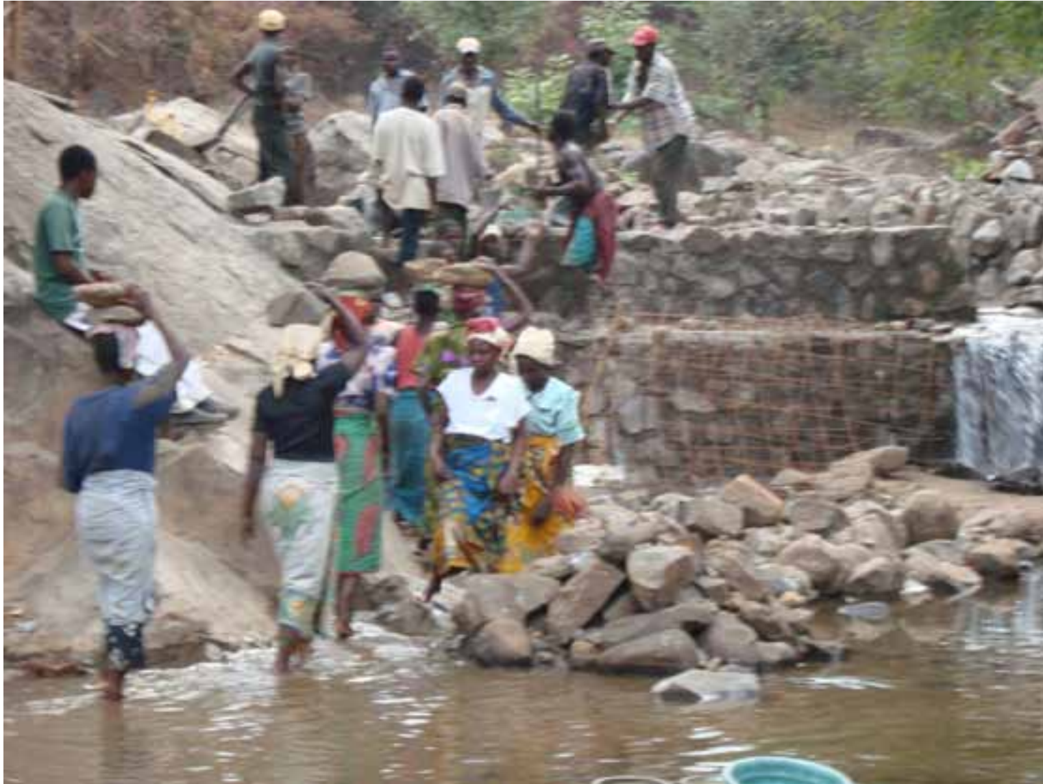
Dam 1 under construction