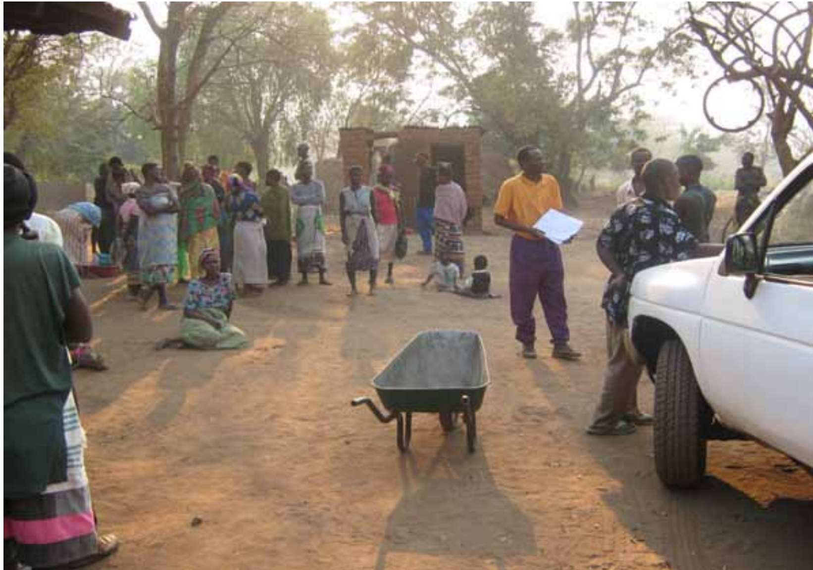
Distribution of day works