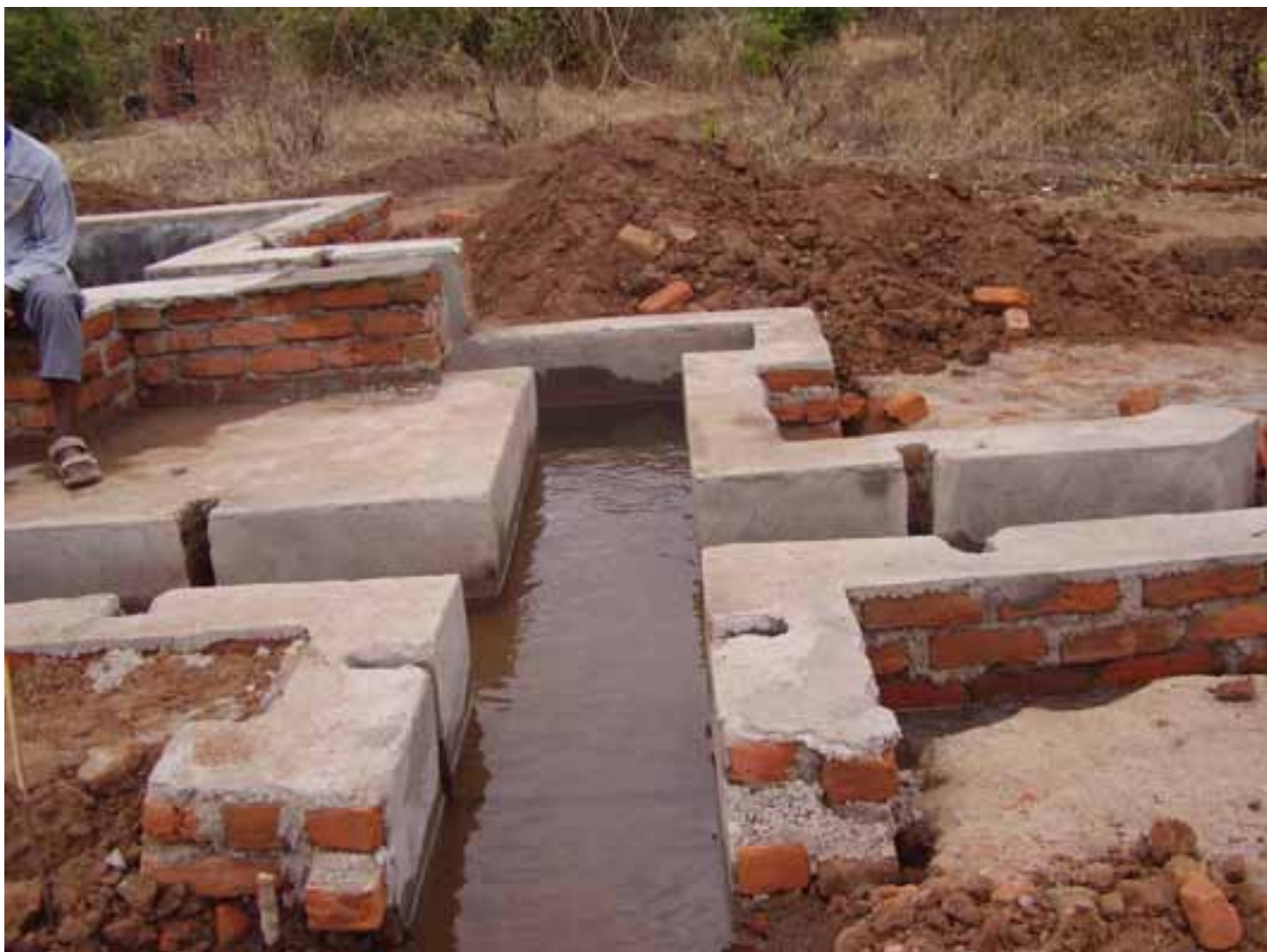
Irrigation water division box under construction