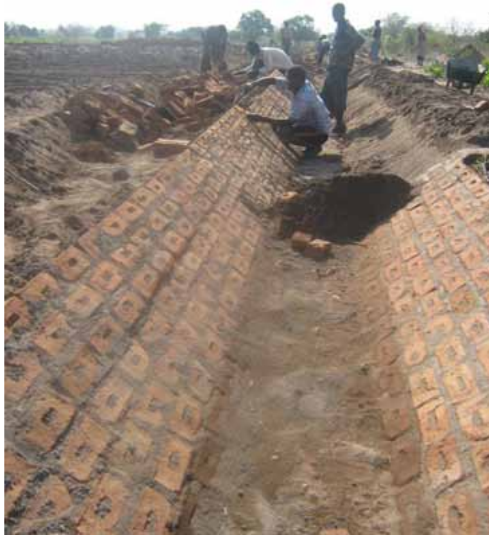
Lining of main canal