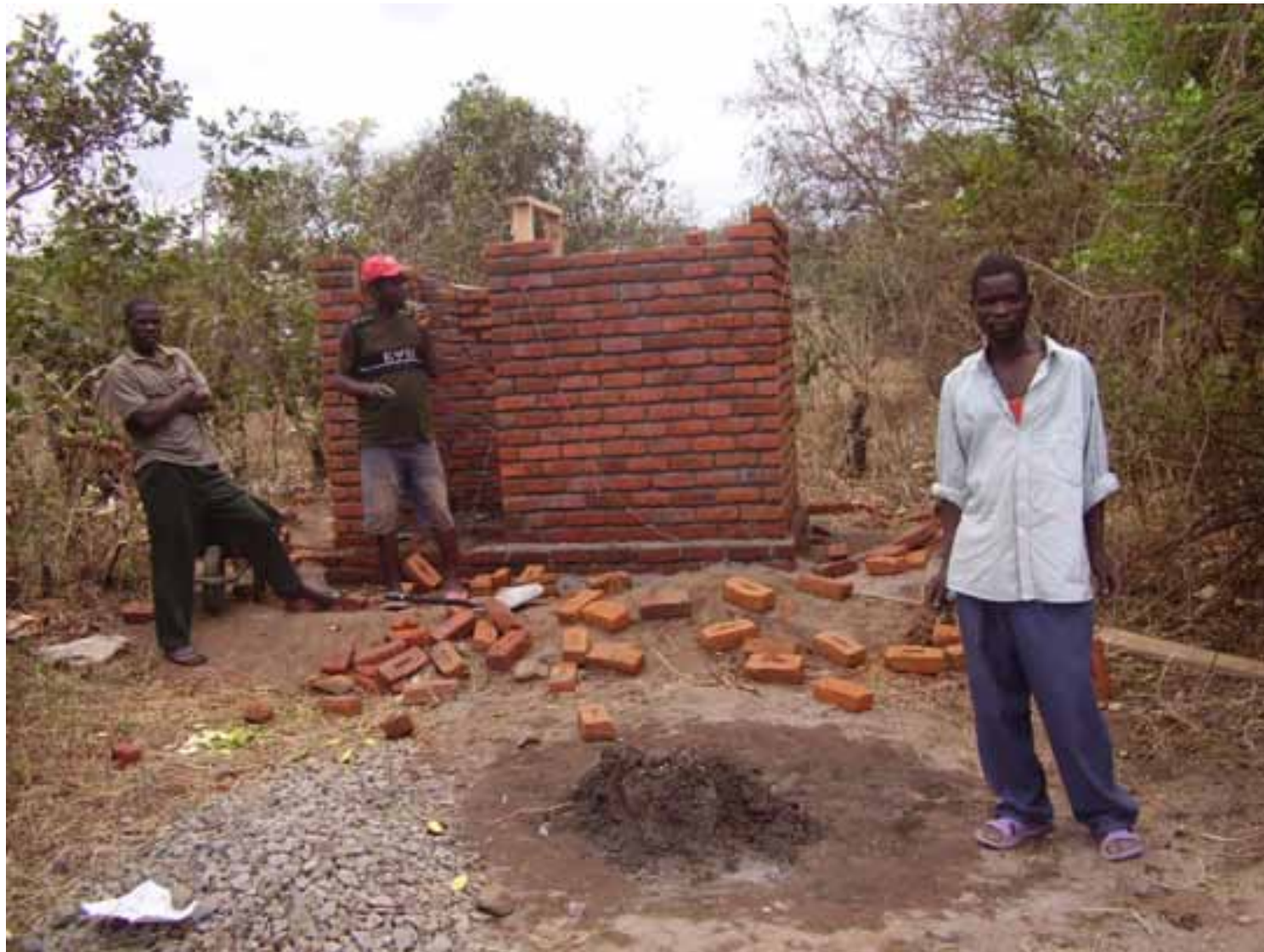
Demonstration sat plat latrine under construction